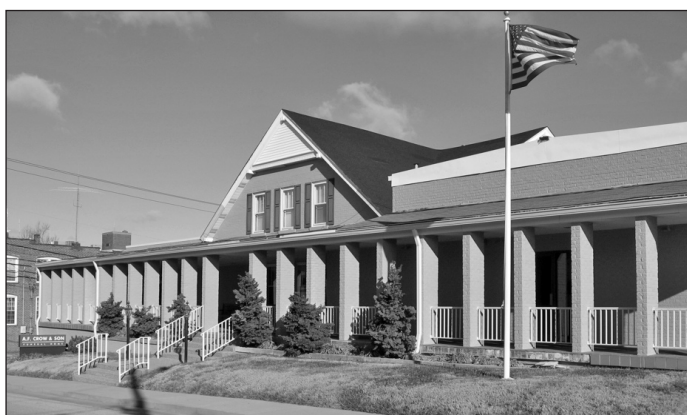
AF Crow Funeral Home